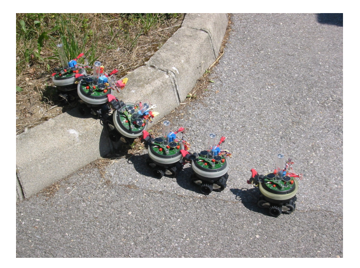
Figure 3. Robot swarm passing a step. Engineers must carefully evaluate how ensembles behave in the face of unforeseen difficulties such as overcoming an obstacle.

We need a sophisticated inspection phase where the ensembles are evaluated against the requirements, but are also carefully investigated for any unforeseen problems or difficulties, such as how a swarm of robots overcomes an obstacle (see Figure 3). The engineering process must also provide traceability mechanisms (for instance, to keep track of which scenarios lead to which requirements on components) and a way to propagate findings back to the modelling phase to improve the current model of the ensemble system (and of its components).