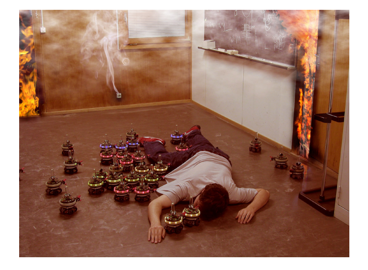
Figure 1. Rescue scenario in which a swarm of autonomous robots cooperates to move a child. Please view a video, available online, to see the scenario in action.<sup>2</sup>

Ensembles in general are software-intensive systems with massive numbers of nodes or complex interactions between nodes. They operate in open and non-deterministic environments in which they must interact elaborately with humans or other software-intensive systems to achieve the overall system's goal. Ensembles have to adapt dynamically to new requirements, technologies or environmental conditions without undergoing redeployment or interrupting the system's functionality,